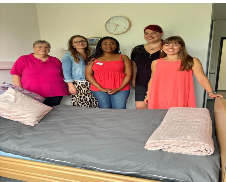
Me and staffs from BZPG and SBZ