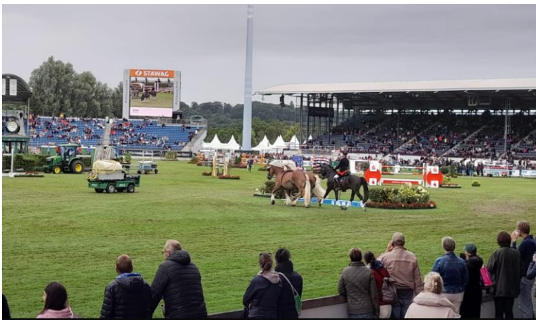
View from the chio-Aachen